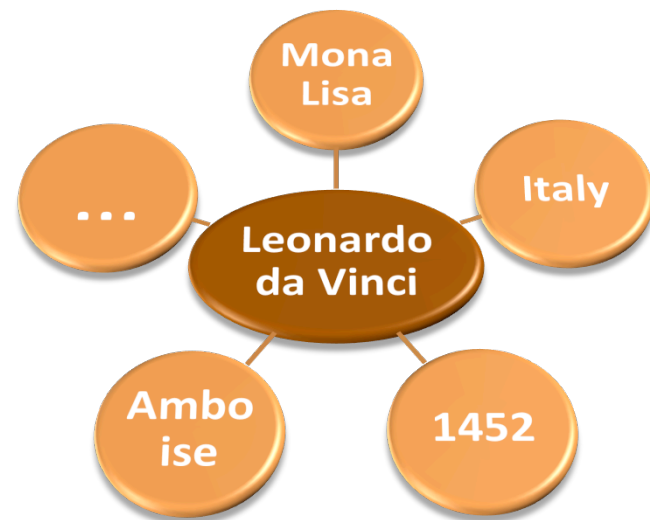
Star graph for an entity

Entity-Centric Summarization: Framework to generate summaries for graph structures (star graph or entity chain)